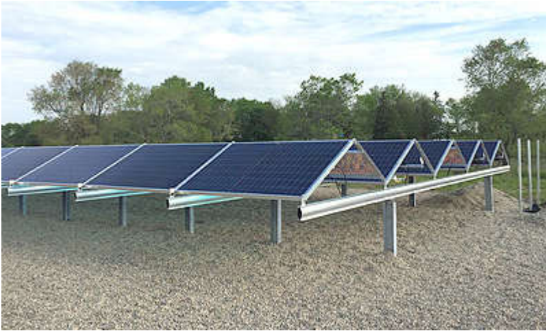
Runestone Electric Association's 44 KW Community Solar Alexandria, MN