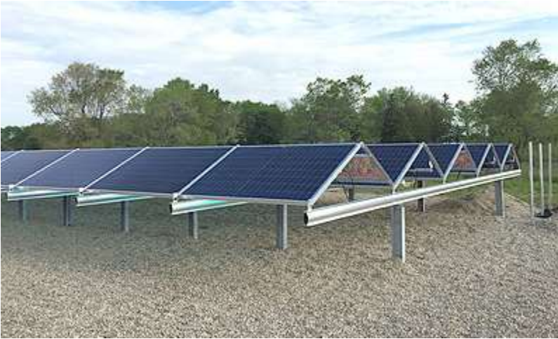
Runestone Electric Association's 44 KW Community Solar Alexandria, MN