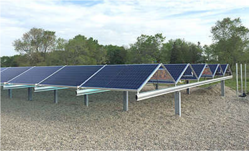
Runestone Electric Association's 44 KW Community Solar Alexandria, MN