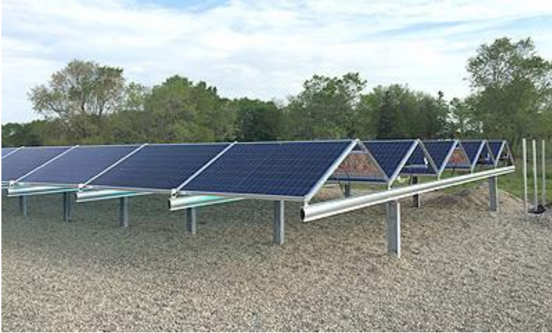
Runestone Electric Association's 44 KW Community Solar Alexandria, MN