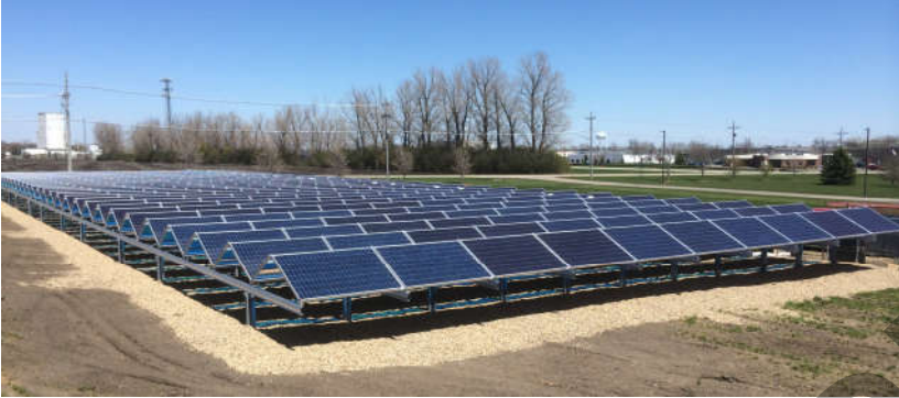
Steele-Waseca Cooperative Electric's 100 kW Sunna Community Solar Garden Owatonna, MN