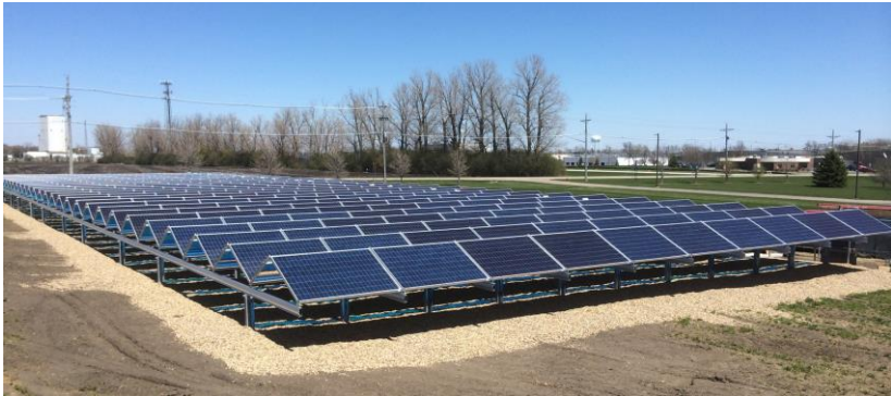
Steele-Waseca Cooperative Electric's 100 kW Sunna Community Solar Garden Owatonna, MN