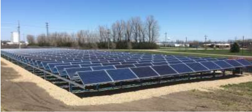
Steele-Waseca Cooperative Electric's 100 kW Sunna Community Solar Garden Owatonna, MN