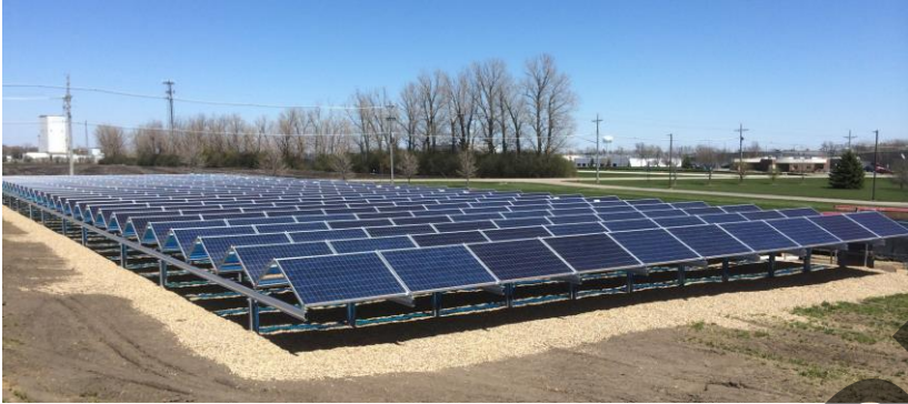
Steele-Waseca Cooperative Electric's 100 kW Sunna Community Solar Garden Owatonna, MN